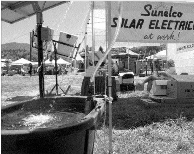
A solar water pump provides a refreshing stream on a warm afternoon. Solar panels, pumps and inverters are among the hardware

People from 20 states and three countries, including Florida, Virginia, Japan, and Mexico visited SolWest Renewable Energy Fair in 2002 to take in exhibits on solar, wind, water and other renewable energy and sustainable living topics.