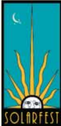
Leading by example—New England’s SolarFest fair is an off-grid event