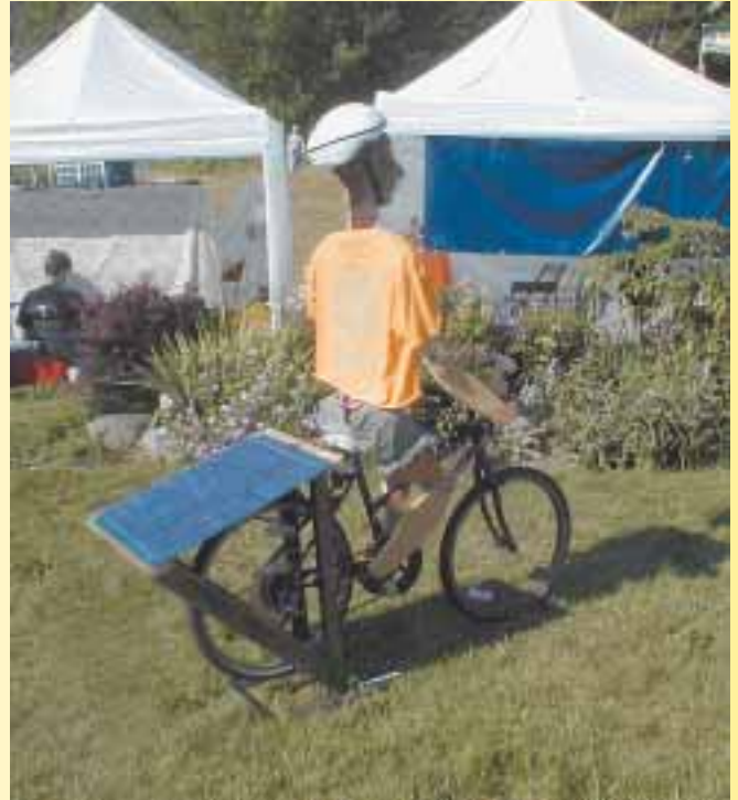
While the solar powered stages rocked, kinetic sculptures like this one rocked to the beat.