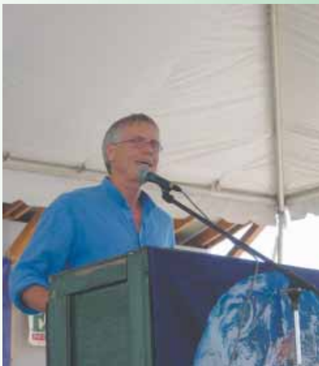
Author Paul Hawken inspires a lively, northern California crowd.