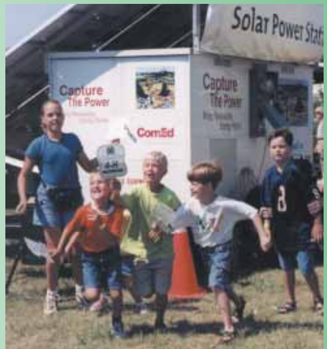
Kids playing in front of a PV trailer. There's lots of activities for kids at the Illinois fair.