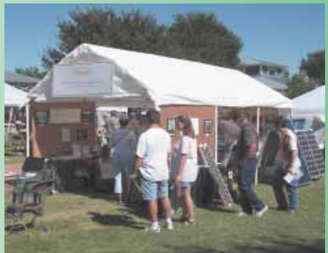
Over 90 exhibitors, including Meridian Solar, were at the fair